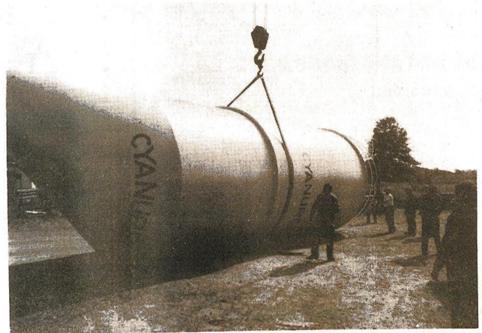
Finished storage tank prepared for delivery.

The past eleven years at Stelfab have been challenging and productive. Increased demand for custom steel and metal fabrication in the industrial complex of Niagara and in foreign markets has continued to stimulate production. Stelfab views the years ahead with confidence and optimism.