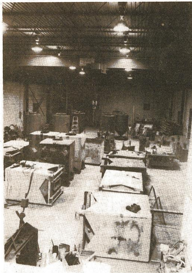
Stelfab, Niagara Falls, fabricating plant assembly area.