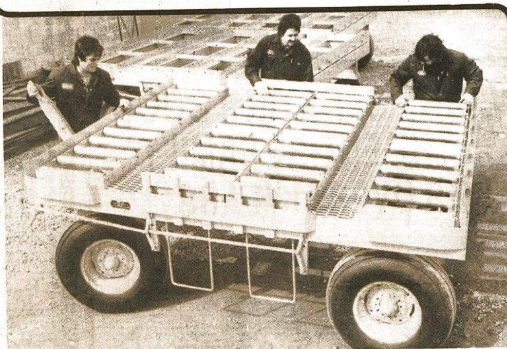
Cargo loading trailer; one of an order of 6 trailers and 2 loading platforms for export to Egypt; manufactured exclusively for Metric Systems Corp. of Florida.