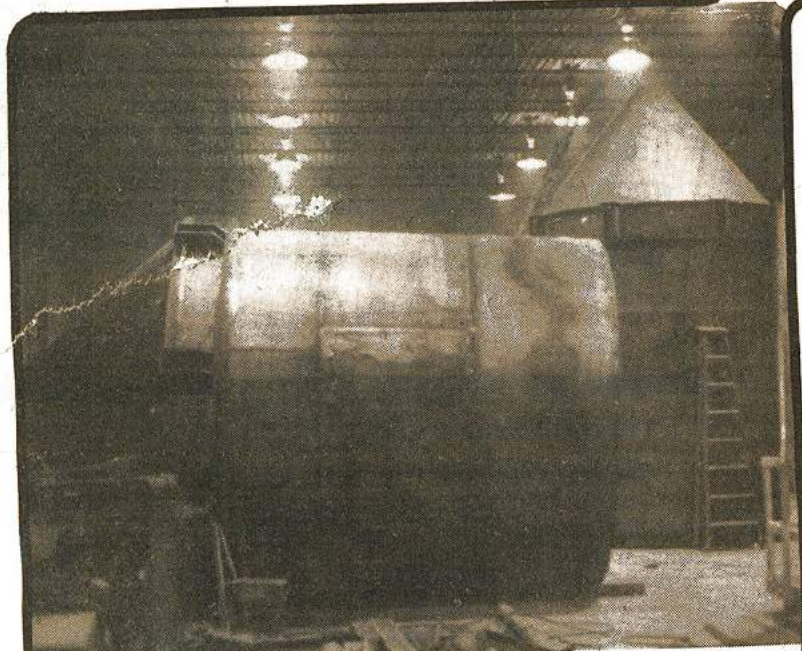
Two steel storage and loading tanks, fabricated and installed for local industry.

During the past ten years Stelfab has met an increasing demand for custom steel and metal fabrication in the industrial complex of the Peninsula. The firm's current expansion program has been completed and production has been extended to include an export trade reaching as far as the Middle East.